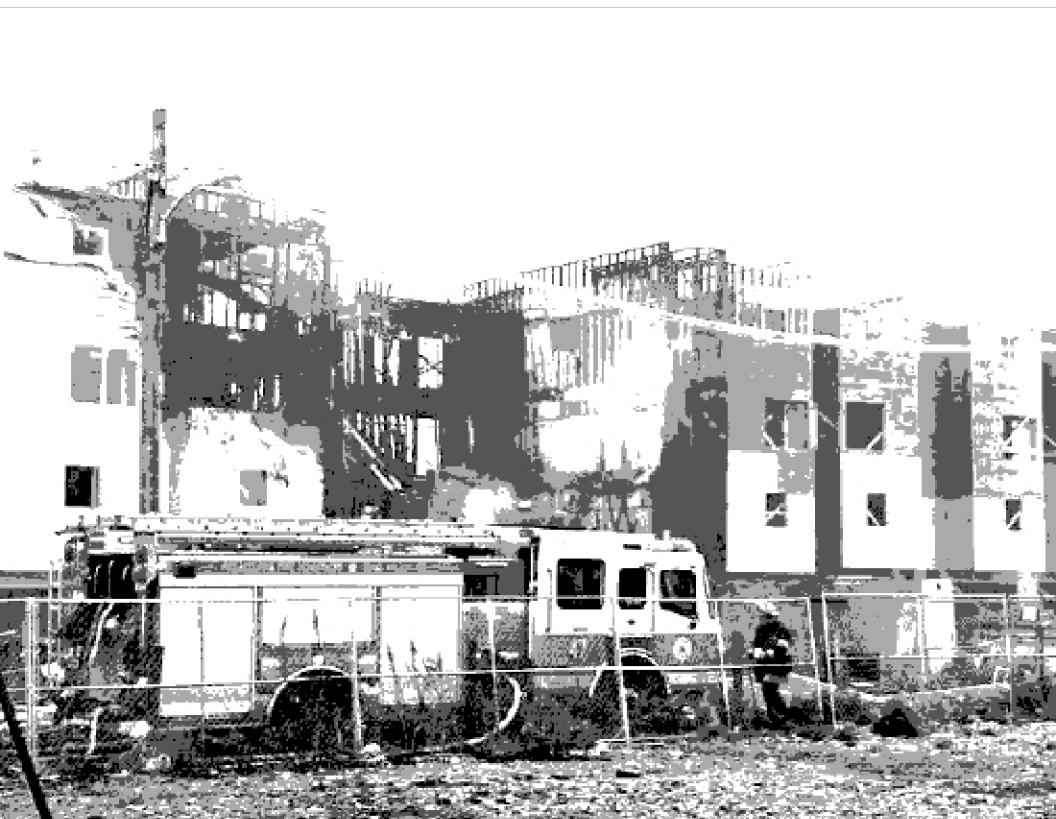
May Day 2017

know they are not welcome” by “creat[ing] environments hostile to gentrification,” giving instructions about how to pop a car tire and explaining that it’s “a fast and easy way to cause damage to our enemies,” with two tires taking less than two minutes. A group calling itself the Radical Action Network wrote the second communiqué, saying they were “following the lead of the rebels of Ferguson and Baltimore,” justifying their acts “because we are tired of living in a system that constructs houses for the rich, while the poor and working class people get nothing but more police, more jails, more budget cuts, more misery.” Anathema included a third communiqué in the issue, which described the removal of surveillance cameras from a construction site in West Philadelphia’s University City district. The anonymous authors justified their attack in similar terms to the other two communiqués, emphasizing both the simplicity of the action as well as the connection between gentrification and policing. They added, “[t]he removal of surveillance cameras makes room for other more damaging anti-gentrification attacks to be taken with less risk” and expressed excitement for the emerging series of such attacks.