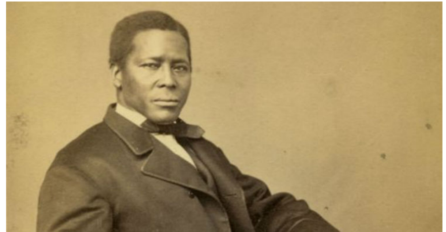
William Still, leader of the Philadelphia Vigilance Committee from the early 1850s onward until its dissolution at the end of the Civil War.

However, by the early 1850s, several waves of repression had left the committee disorganized. These included various anti-abolitionist riots throughout the 1840s, and a string of crippling lawsuits against those who defied the Fugitive Slave Law, including participants in the Christiana Riot of 1851, wherein a slave-owner was shot and killed after attempting to capture a "fugitive." A new organization was needed, so in 1852 William Still and other abolitionists established a new Vigilance Committee to fill the void left by the older, scattered one. 8