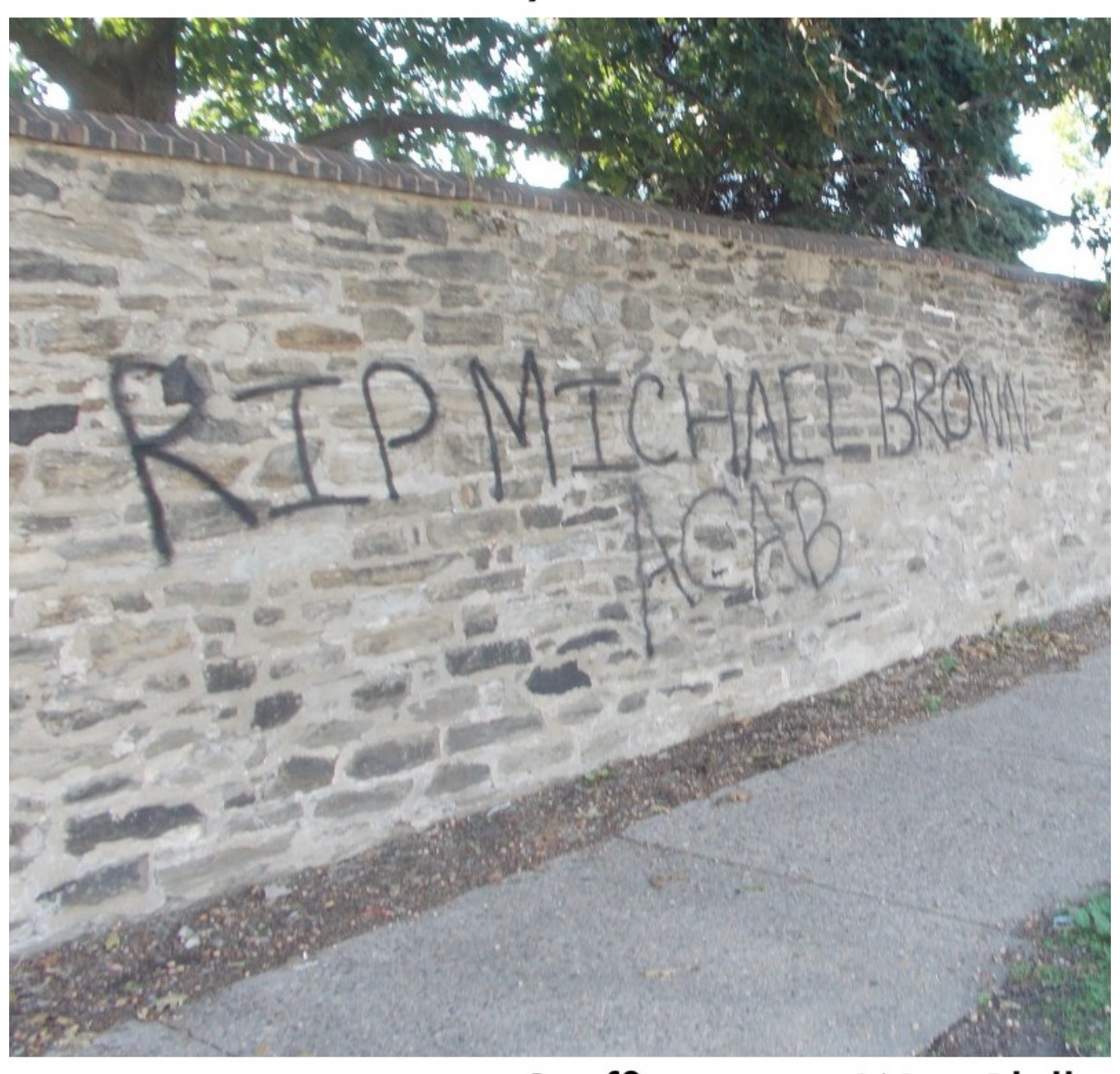
Graffiti seen in West Philly

We're interested in taking steps toward creating a collective memory of opposing the state, white supremacy, patriarchy and capital that focuses on our ability to revolt and fight instead of seeking out narratives that prioritize our victimhood within the system.