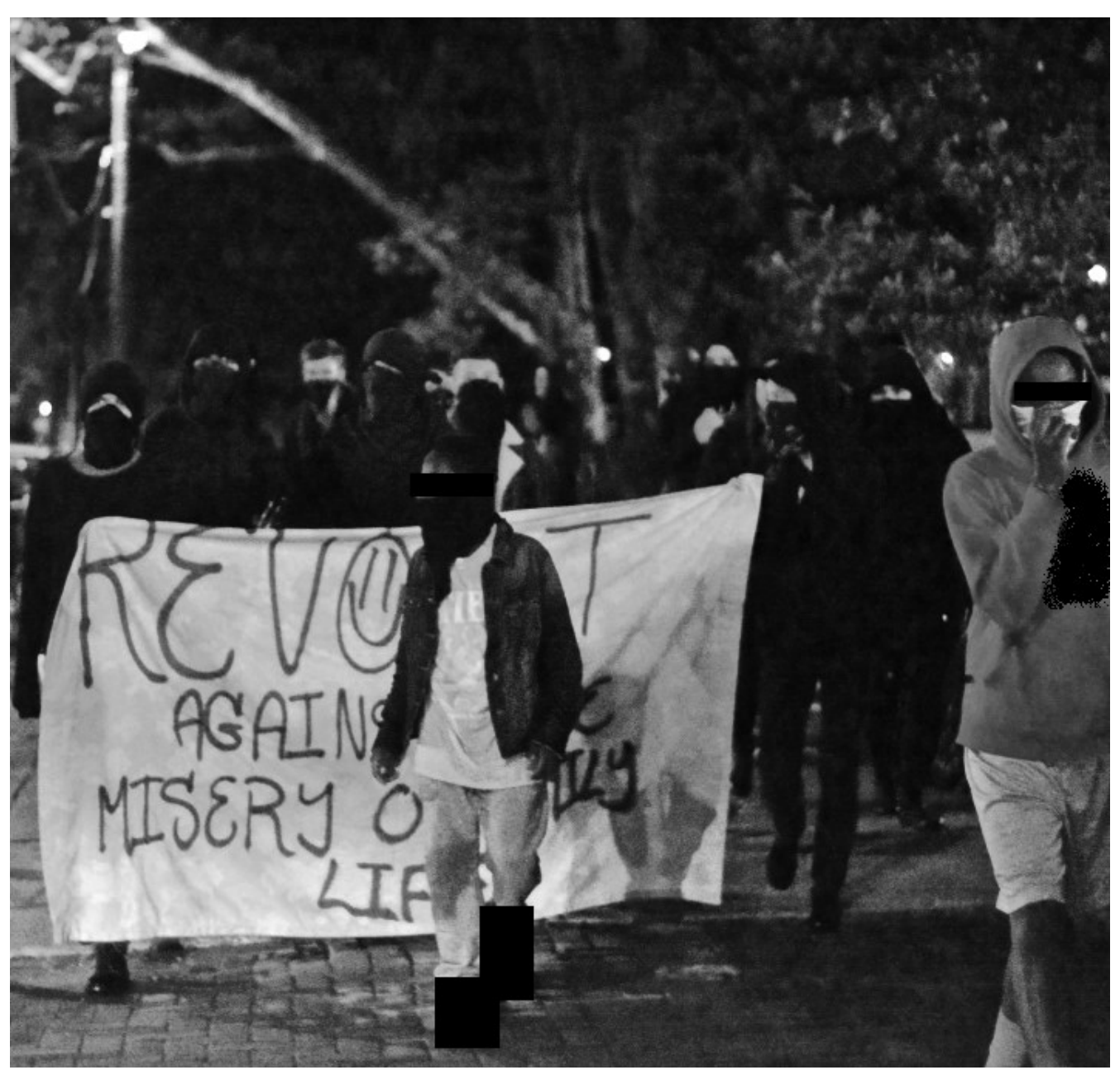
FTP March August 23<sup>rd</sup>

Fight The Police! Solidarity With The Rebels In Ferguson!